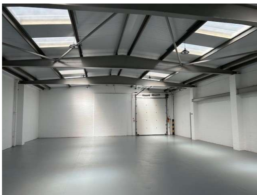
Indicative photo following refurbishment